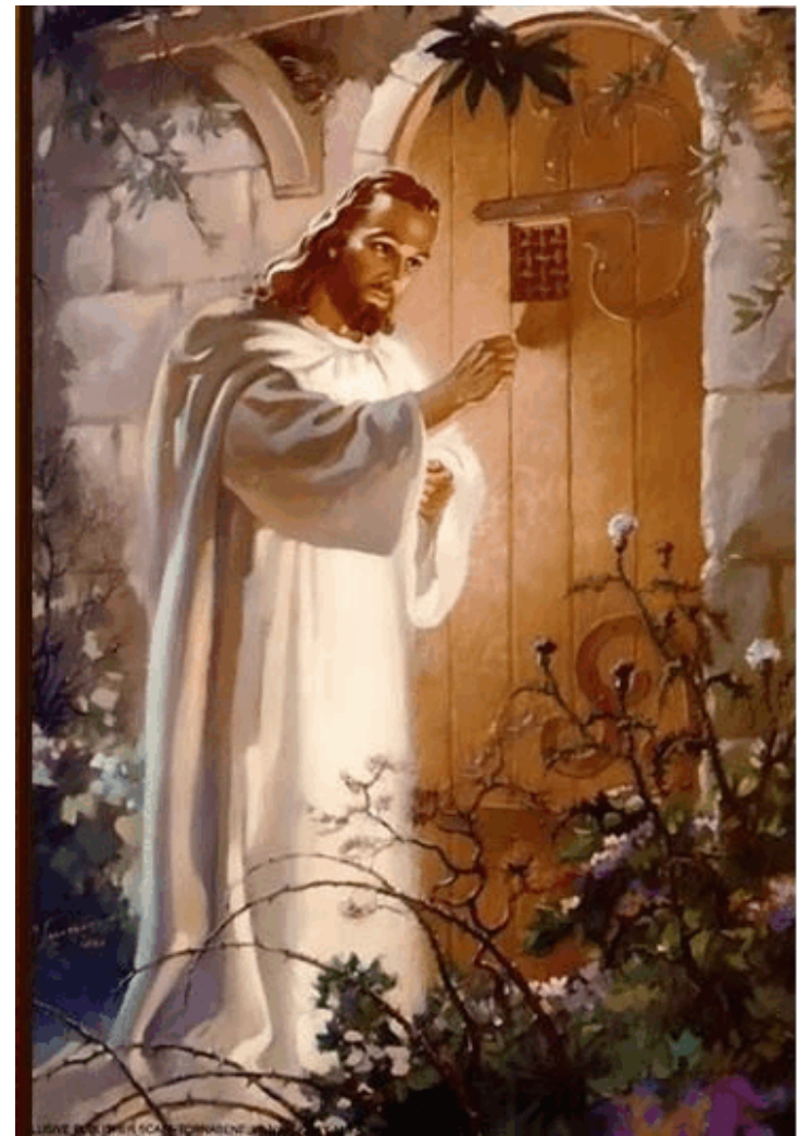
“Behold, I stand at the door and knock.”

Monday, July 26 Jeremiah 15:15-21 Jeremiah was caught in the middle. #29 Tuesday, July 27 2 Corinthians 4 What kept Paul going? Love for lost souls! #74 Wednesday, July 28 Matthew 16:21-26 It’s our desires that control our lives. #421 Thursday, July 29 Matthew 17:24-27 Jesus fulfilled His cultural responsibilities. #91 Friday, July 30 Romans 12:1-8 Serve Jesus to bring blessing to others. #496 Saturday, July 31 Romans 12:9-21 What a wonderful catalog of guidelines! #428